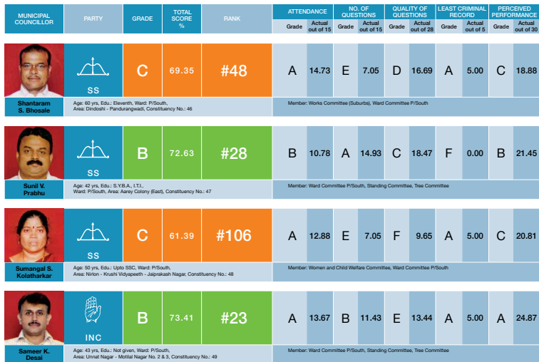
Figure: Snapshot of performance index